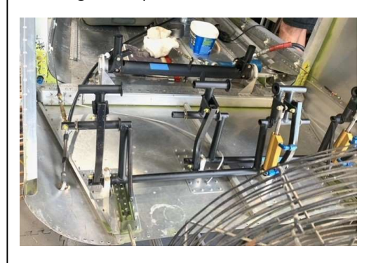
Cessna 150 - Steve Wing Root bolt finally removed with 4 workers