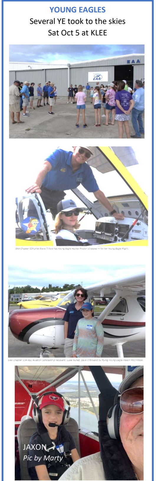
YE photos courtesy of Ted Luebbers