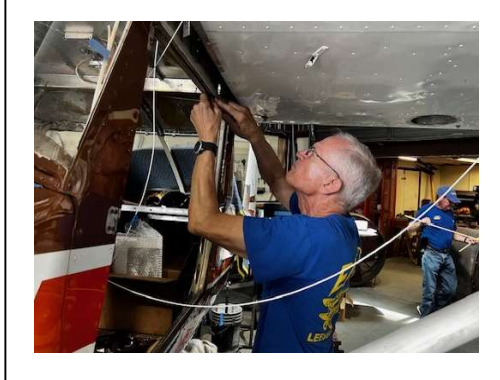
Stinson Future up for discussion